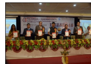
Release of Proceedings