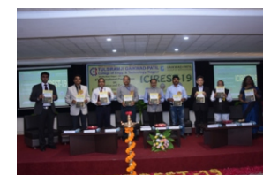
Release of Proceedings